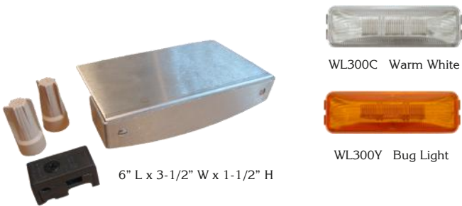
WL300C Warm White

The commercial grade stainless steel fixture installs easily under wall cap or step material. A 72 inch Wire Harness and choice of cable connector are included.